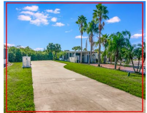
~2500 Sq Ft Concrete